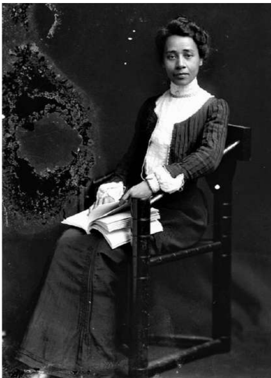
Dr. Anna Julia Cooper